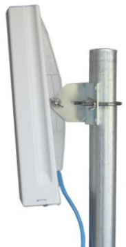
EZ-Bridge-LT™ tool-less installation

Operating: -35°C to 60°C (-31°F to 140°F) Storage: -40°C to 80°C (-40°F to 176°F)