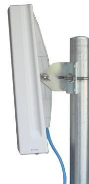
EZ-Bridge-LT™ tool-less installation